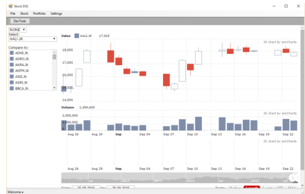
Figure 2 – Main Interface

The main interface of the application is illustrated in the figure below. The main interface includes stock prices chart and recommendation of stock from the fuzzy inference system.