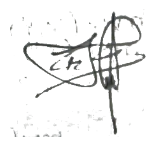
Albertus Kelvin / 13514100