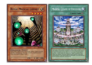
Picture 1.3 – Royal Magical Library card (left) and Magical Citadel of Endymion card (right)

effect implies that we win the duel when we have all of the card above in the hand. Basically, the objective of this deck, is to draw cards as much as possible until these five cards are in our hand. There are so many variation of Exodia deck out there. One of the popular deck variation is using Royal Magical Library card as the main engine. The text in this card said that, "Each time a Spell Card is activated, place 1 Spell Counter on this card (max 3). You can remove 3 Spell Counters from this card to draw 1 card". Basically, every 3 spell cards is activated, we can draw 1 card. This variation usually also using Magical Citadel of Endymion card as the sub-engine. This card can support Royal Magical Library by providing additional Spell Counter for the card to use the effect.